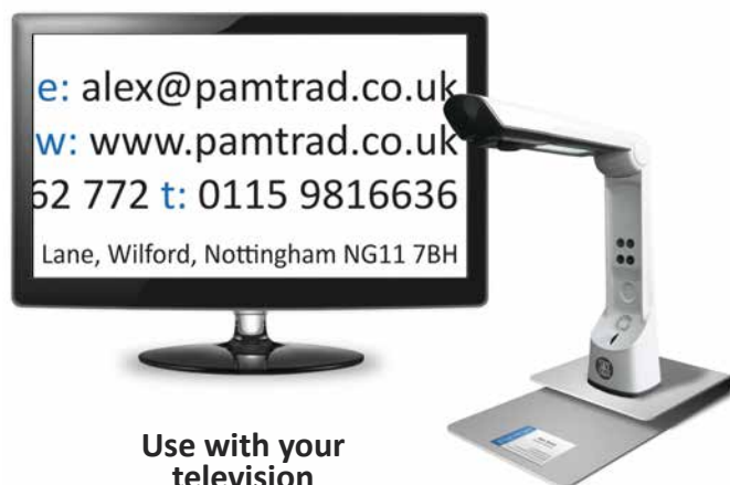
Use with your television

To store the PC-Eye, pull out the cables, and fold it up.