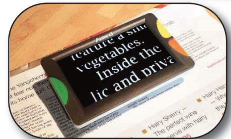
Handle folded under